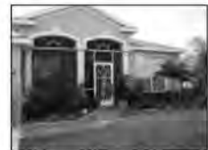
Custom Screen Rooms