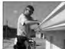
6" Seamless Aluminum Gutter