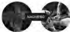
Peppermint leaf oil sac