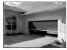
Motorized Garage Screens

Custom Pool Enclosures Screen Rooms Vinyl Siding Soffit and Fascia Aluminum Handrail Acrylic/Glass Rooms Complete Rescreens / Repairs