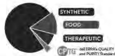
Grades of Essential Oils